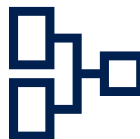
Project Service Automation